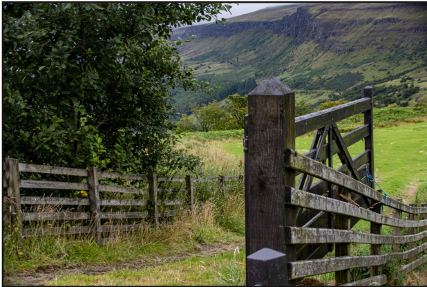
In many parts of the country development plans make it effectively impossible to build in rural areas.

3) The precise figures are not important. The point is that there isn't necessarily a shortage of land.